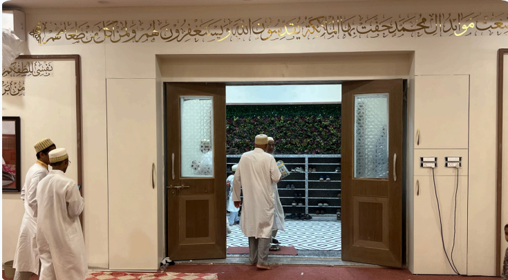
Clockwise from top left: Zainy Masjid, Burhani Hall, Waaz at Fakhri Manzil, Entrance to Fakhri Manzil, 1st Floor of Fakhri Manzil