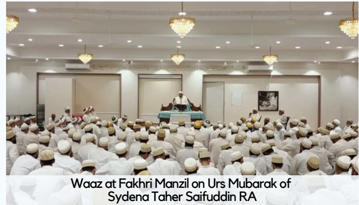
Waaz at Fakhri Manzil on Urs Mubarak of Sydena Taher Saifuddin RA