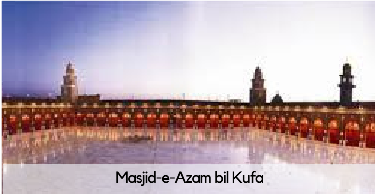
Masjid-e-Azam bil Kufa