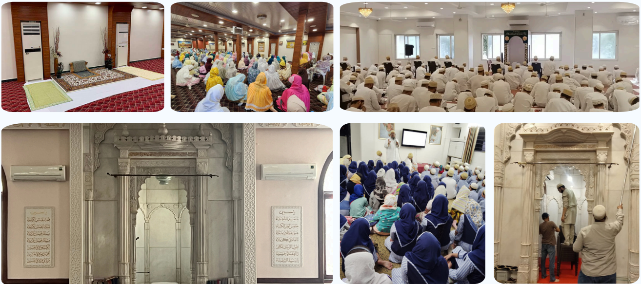
Clockwise from top left: Burhani Hall, Bairao Majlis at Burhani Hall, Namaz at Fakhri Manzil, Zainy Masjid, Jamali Madrasah, Maintenance of Zainy Masjid

Major structural repairs and renovation is done after explicit written approval from the Tamiraat Department and Sigatul Waqf/Trust. Jamaat can obtain explicit written permission from Sigatul Waqf for issuing any legal notices or filing cases.