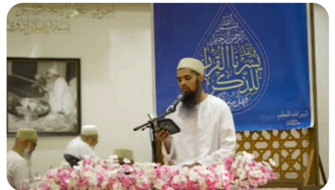
Left to right: Mahal-us-Shifa, Preparation of kharak, Asbaaq, Letter of thanks on behalf of Madrasas, Distribution of food, Khatmul Quran