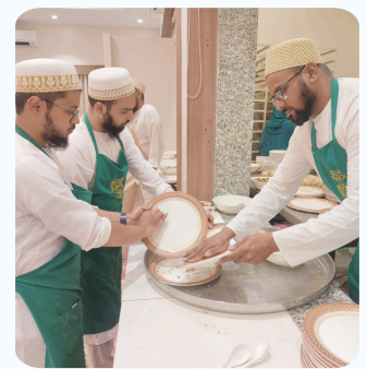
Left to right : Manda making during Ramadan, Food preparation in FMB Kitchen, Preparation of thaali, Serving of thaali, Serving of food