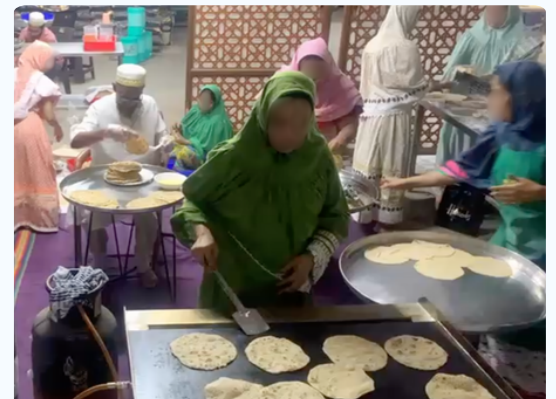
Left to right: High-grade kitchen equipment at FMB, storage, pantry, washing area, food preparation, food packing, roti preparation